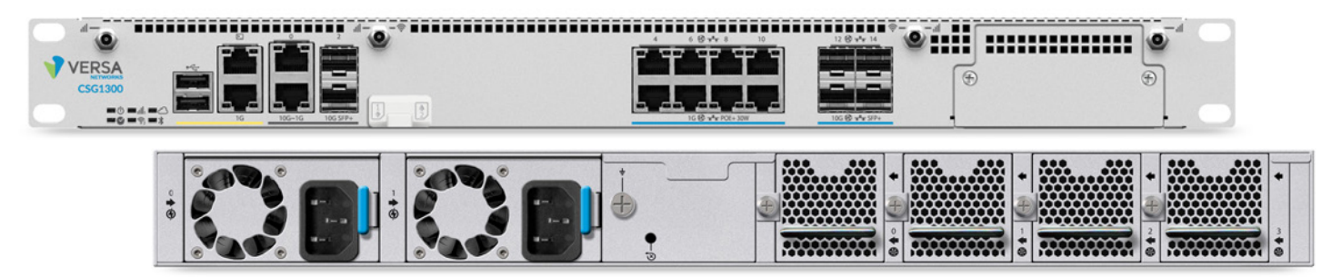
CSG 1000 series Front View and Back View

For rack-mounted deployments, the port side of the Versa CSG1000 series appliances is designed to simplify operations and accessibility and to improve visibility of device operational status and health. Status LEDs provide succinct visualization of the operational status of the device and of the Bluetooth, WLAN, and LTE connections.